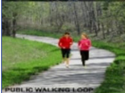
PUBLIC WALKING LOOP