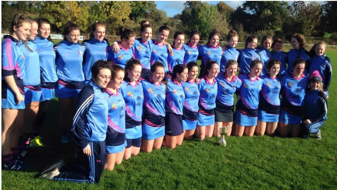
Nenagh Éire Óg – County Junior A Camogie champions.