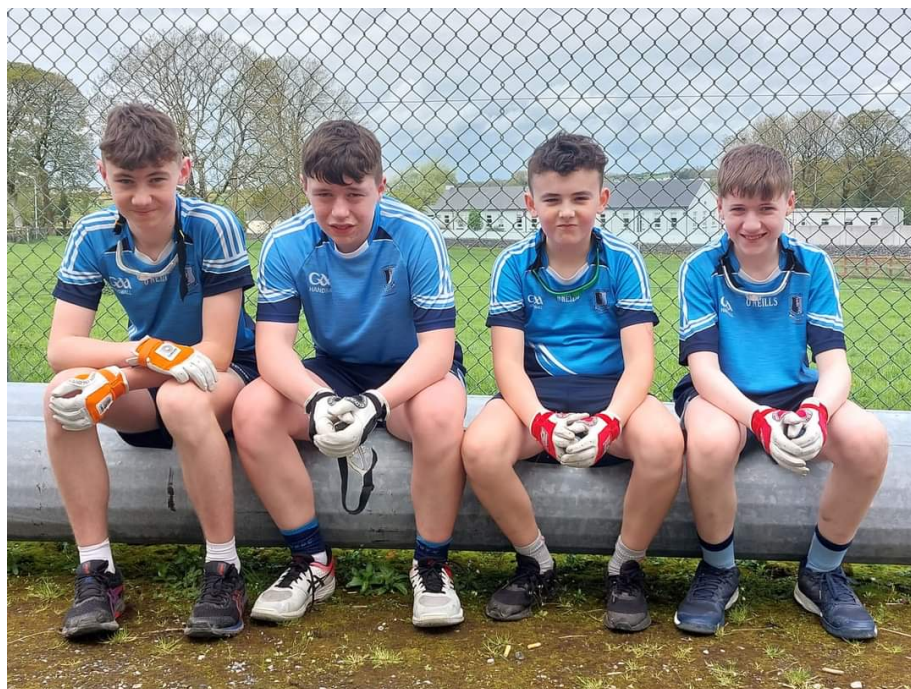
Nenagh Handball Club Féile Team 2023