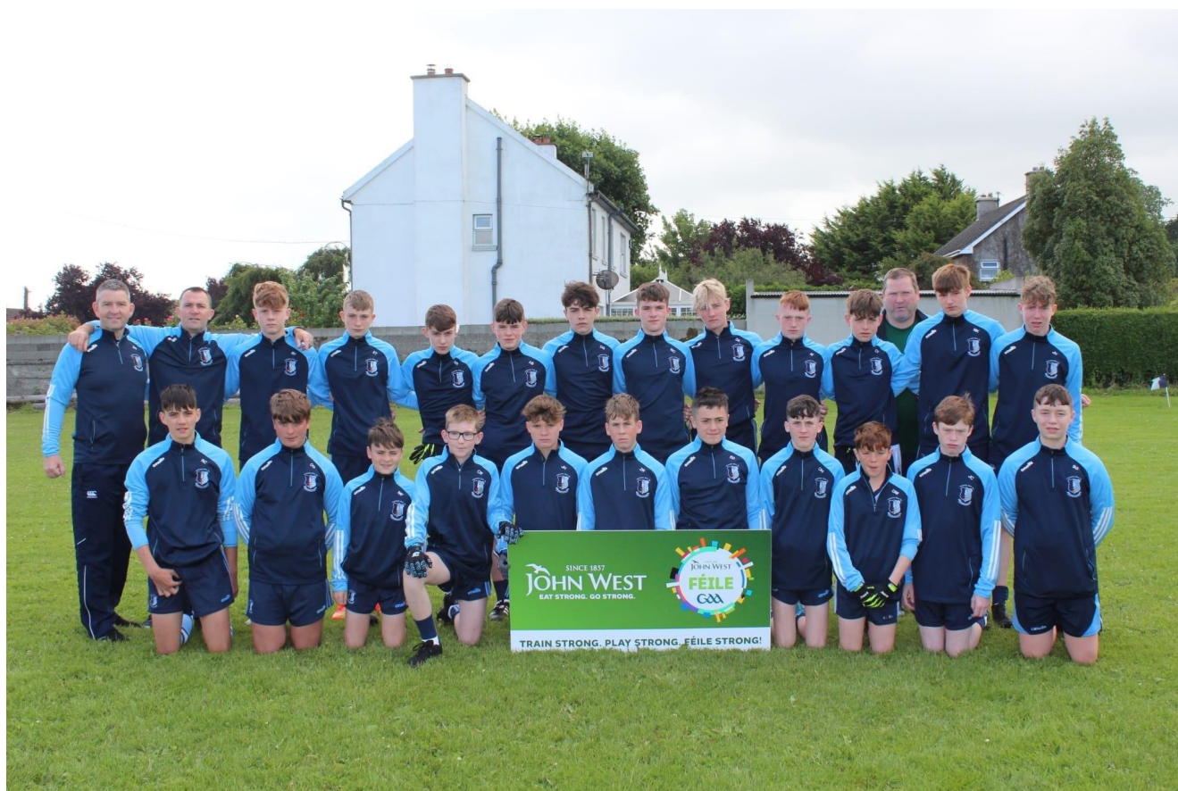
Nenagh Éire Óg Féile Panel 2023