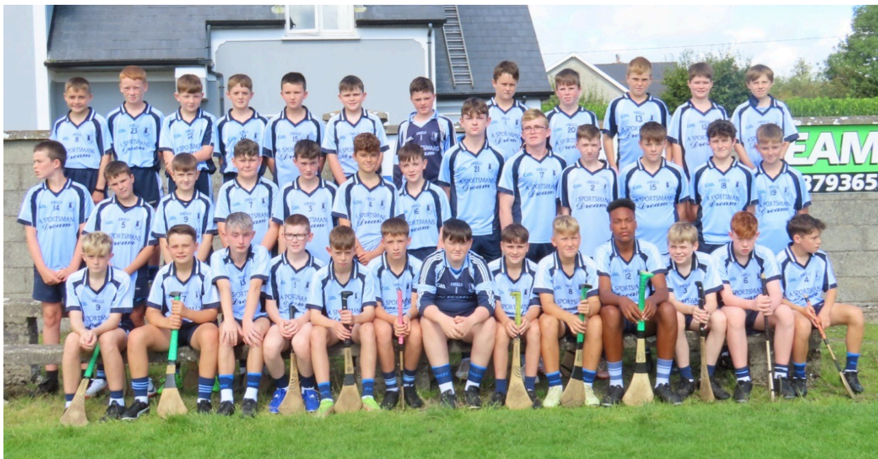
Nenagh Éire Óg U13 Panel 2023