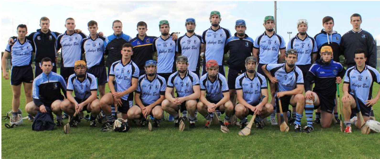
THE NENAGH ÉIRE ÓG PANEL WHICH WON THE DR FOGARTY CUP AT TEMPLETOUHY