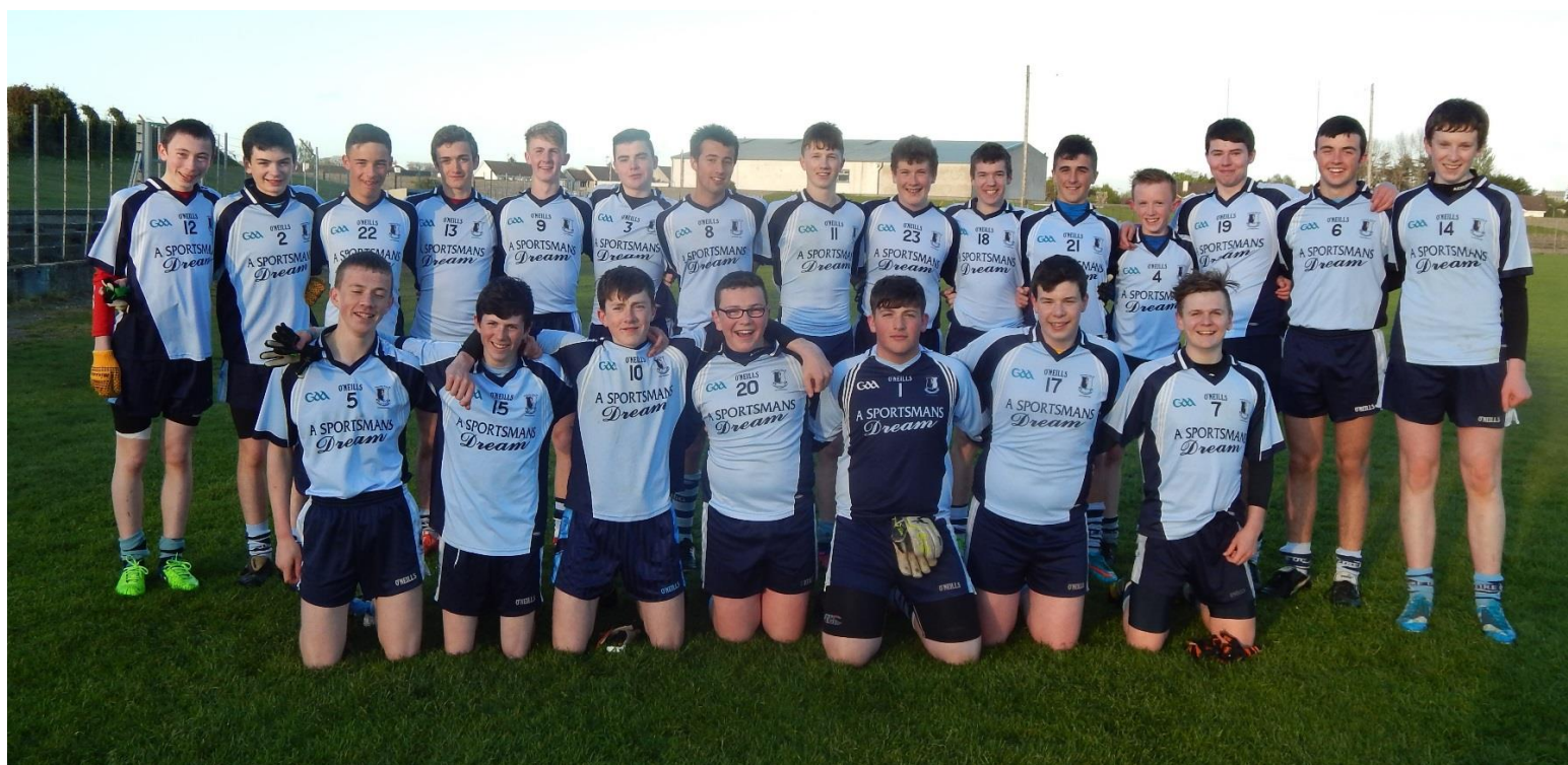
NENAGH ÉIRE ÓG UNDER-16 A NORTH FOOTBALL FINALISTS 2015 FOLLOWING WIN OVER BORRISOKANE. THEY FACE INANE ROVERS IN THE FINAL