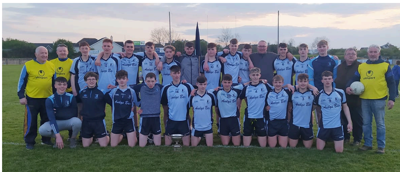
Nenagh Éire Óg - U19 B North Football Champions 2022