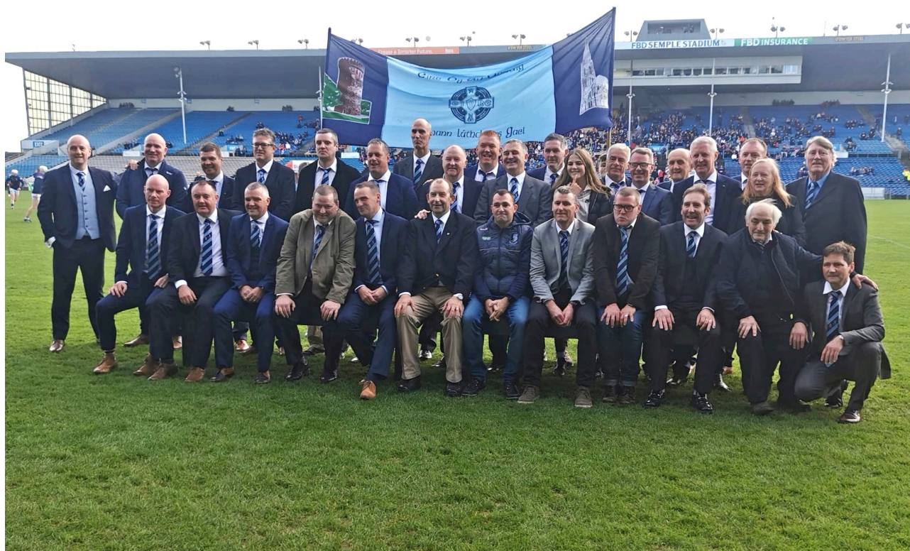
The Nenagh Éire Óg Jubilee Hurling team - County Champions 1995

SENIOR CLUB EXECUTIVE: Our 2023 Executive Committee as assigned by Congress will comprise of the 9 roles highlighted in Blue and at least five, but not more than ten other Full Members. and as Chairperson I will work with a combination of the above Team and avail of their expertise in line with their roles on any specific project/s etc. as and when they arise.