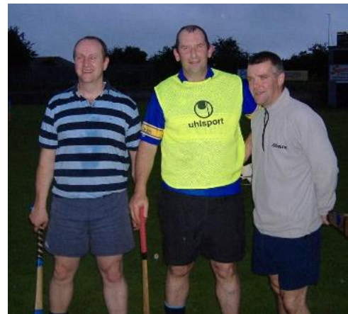
The three lads will be lining out again in Croke Park this September for the 25 th anniversary